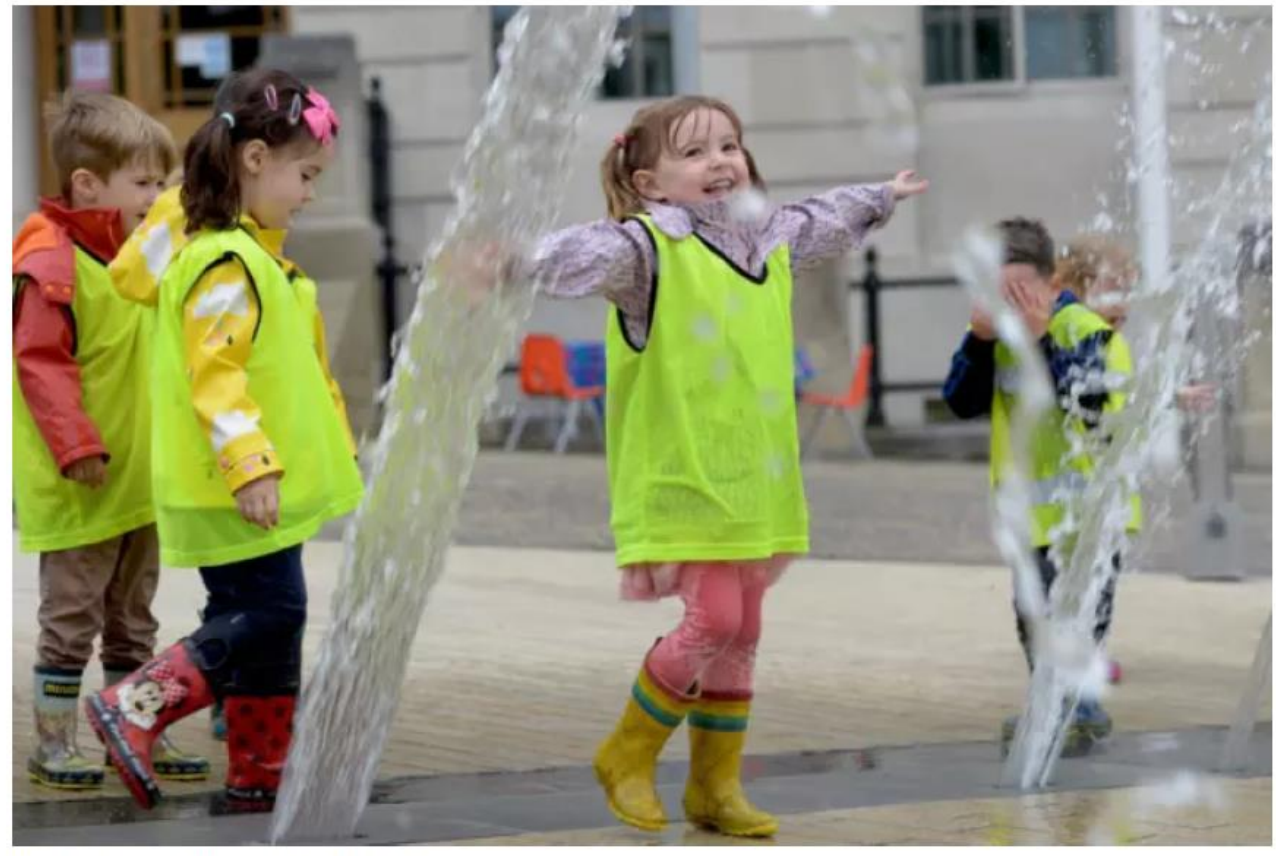
Launch of Smokefree Zone at Barnsley PALS Garden.