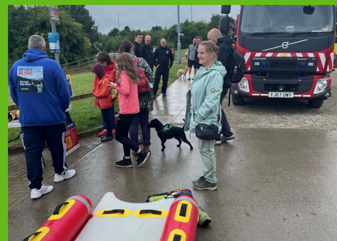
New throwline installed

Installed discreet wildlife cameras to monitor safety equipment and potentially prosecute individuals responsible for any damage