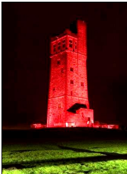
Castle Hill monument

Landmarks included City Hall, Fountains Park and City Railway Station in Bradford, the Civic Hall and Town Hall in Leeds (and bus shelters and telephone kiosks), Batley Town Hall in North Kirklees and Castle Hill monument in Greater Huddersfield.