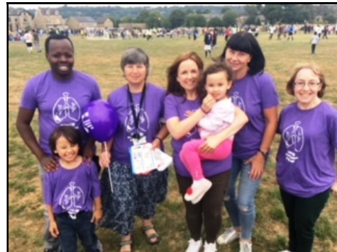
Some of our team!

The North East took a different approach on World TB Day. Targeted letters were sent to GPs to raise awareness about the unusually large proportion of TB cases in the North East who are white UK-born, particularly as these cases are associated with greater diagnostic delay. The letters also included contact details for GP's local TB teams. CCGs supported this work by distributing the letters. In addition, the same message was given in professional-facing videos made by the health protection team in-house which were shared on Twitter.