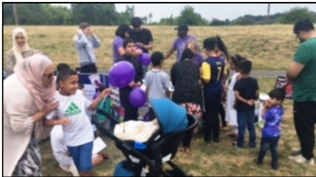
Families attending Let's Unite 2018

Response to the importance of LTBI testing was generally positive, with any negative comments providing useful insight for local engagement needs.