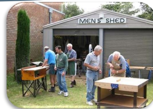
Men in Sheds